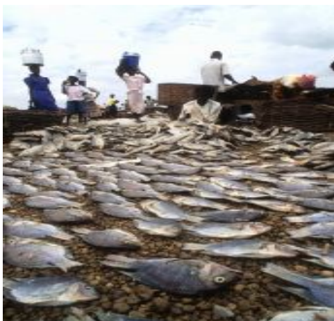
In Ghana, traditional fish processing employs many people.

Malawi: Migrant fishers are a distinct social group, compared to sedentary rural farming populations; the fishers exploit and invest in particular fishing opportunities, and are generally better-off (wealthier) than farmers; fishers use wealth as a lever to integrate within rural population/economy, especially to secure access to land (FMSP R7336).