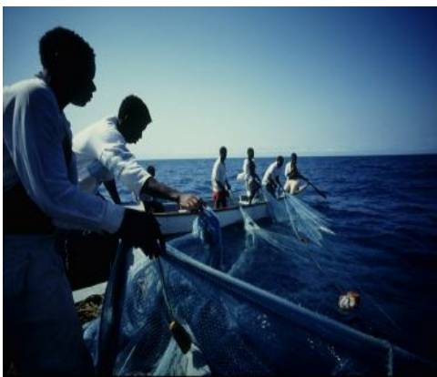
In Malawi, fishing on Lake Malawi is usually a part-time and seasonal activity.

Cambodia and Bangladesh: In Cambodia, valuable inland fish resources are increasingly under the control of private individuals who exclude other users – especially poor rural households (who included fisheries in farming-fishing livelihood strategy). In Bangladesh, privatisation of fisheries is also common. In both Cambodia and Bangladesh, water management schemes are impacting negatively on fisheries; fisheries and other sectors need to be included in water/CPR management strategy (FMSP R8118, R5953, R8210).