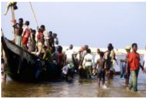
In West Africa, small-scale coastal fisheries are an important source of livelihoods.