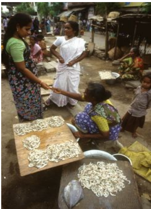
In India, the fish marketing sub-sector provides employment for many women, whereas men are mainly employed as fishers (a common pattern in most Developing Countries).