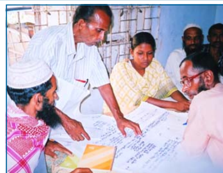
Testing of the Guidelines with stakeholders in Bangladesh.

Feed-back will also be sought from managers of the fisheries of Lake Victoria who have used the guidelines to aid management planning and the identification of appropriate data collection strategies.