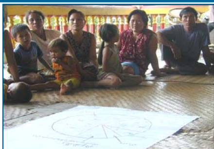
Discussion of results from catch composition surveys with users, Lao PDR

The Guidance can be used by Local Management Institutions (LMIs), National Fisheries Management; Non Governmental Organisations (involved in fisheries management), Fisheries Research Institutes, Fisheries Training Organisations and other stakeholders.